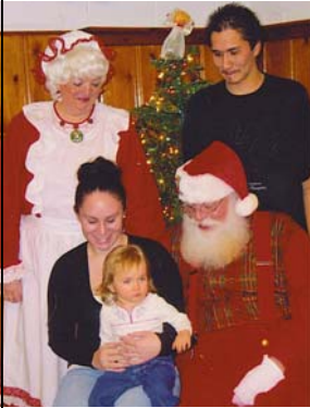
Sharing the night with Santa