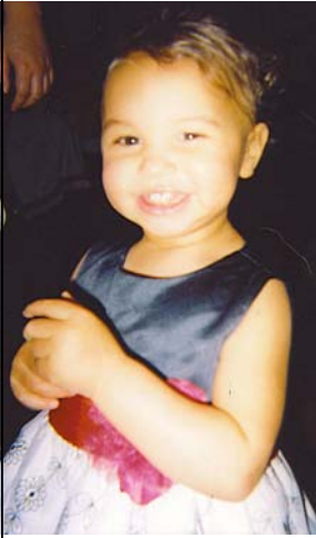
"A smile to light the world"