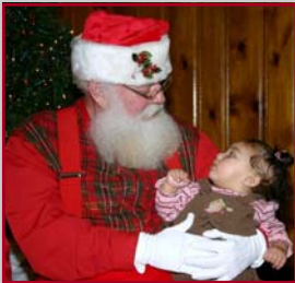
"Nice to meet you!"