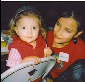
Everyone Loves Christmas