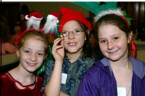
Christmas brings more smiles